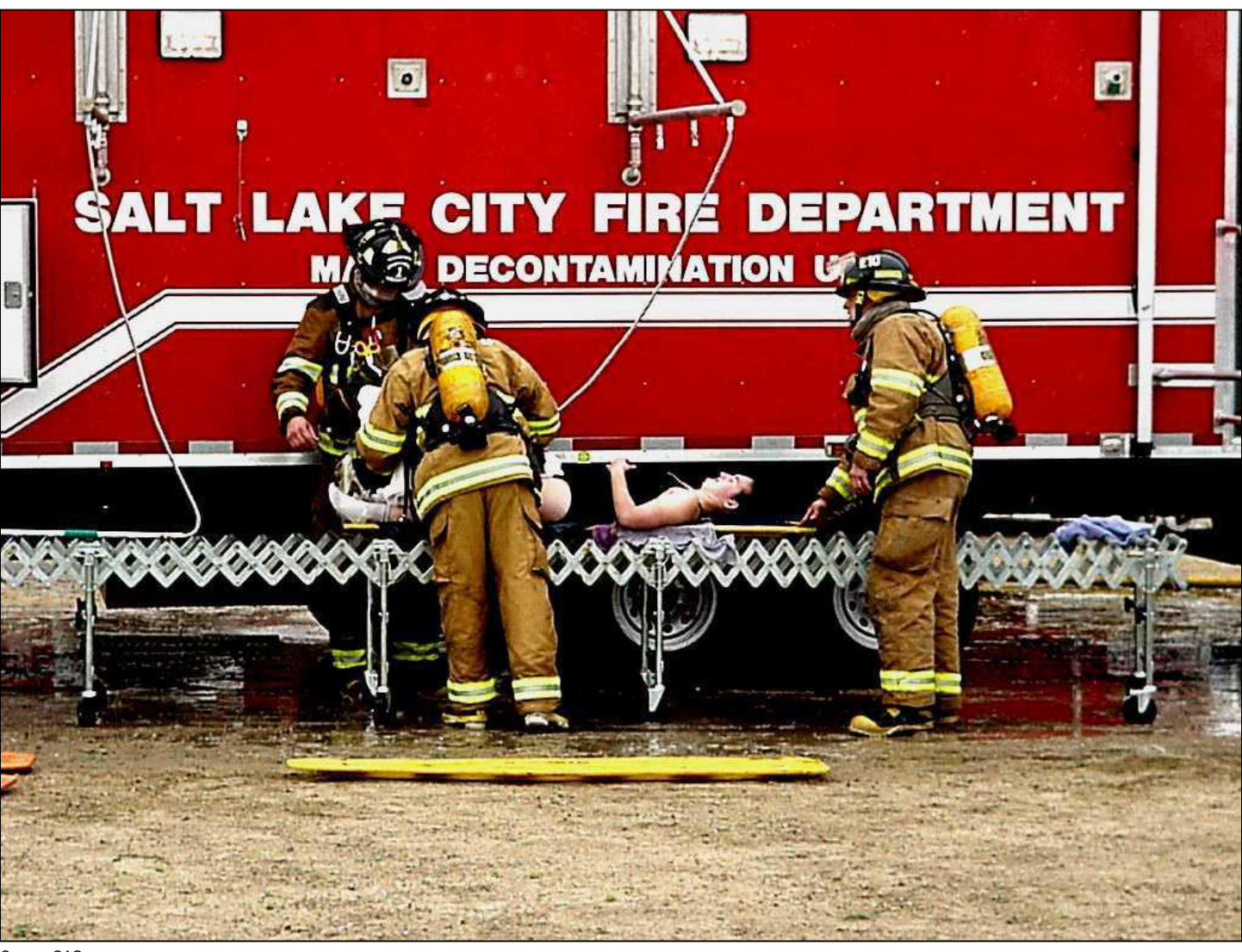
Figure 2: The Homeland Security strategy contains an overall goal on recovering from terrorist attacks, a subordinate objective on emergency preparedness and response, and a specific initiative to prepare for chemical, biological, and nuclear decontamination