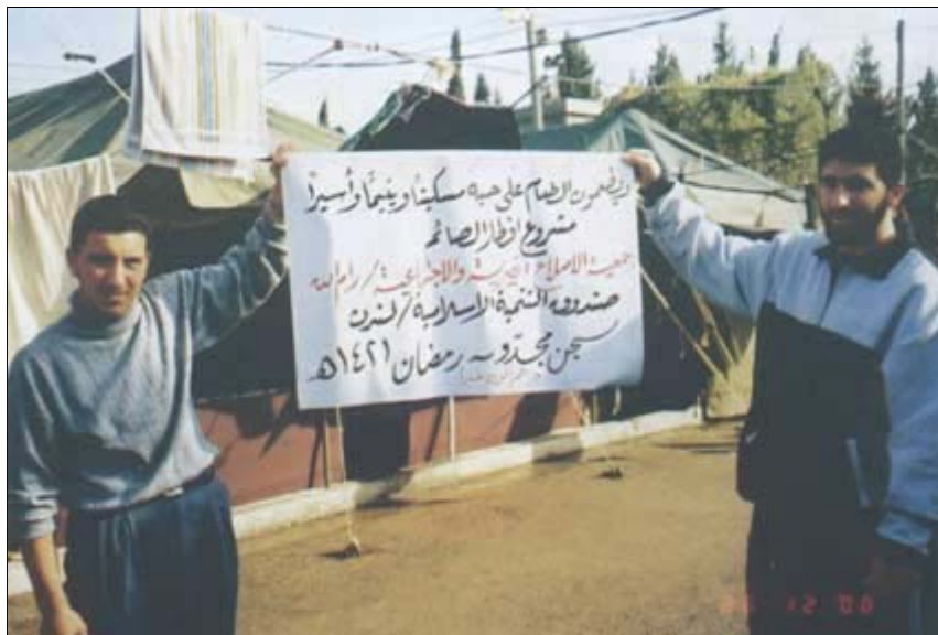
Palestinian terrorists in an Israeli jail holding a sign expressing thanks to Al-Islah Charitable Society, Ramallah , and to the Islamic Development Fund [Interpal] in London, for their support of “the unfortunate, the orphans and the imprisoned” (Al-Islah Charitable Society report, 2000).