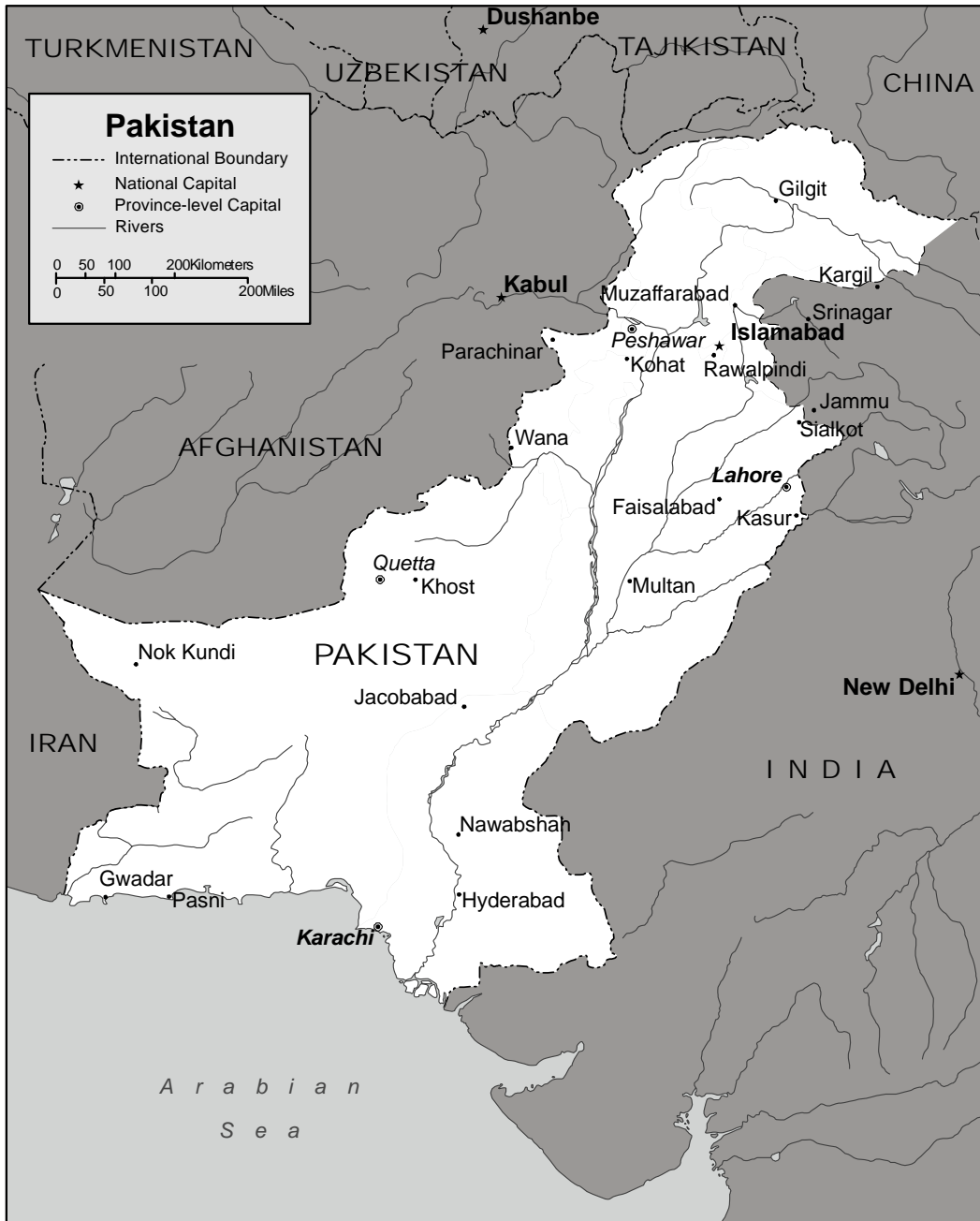
Figure 3. Map of Pakistan