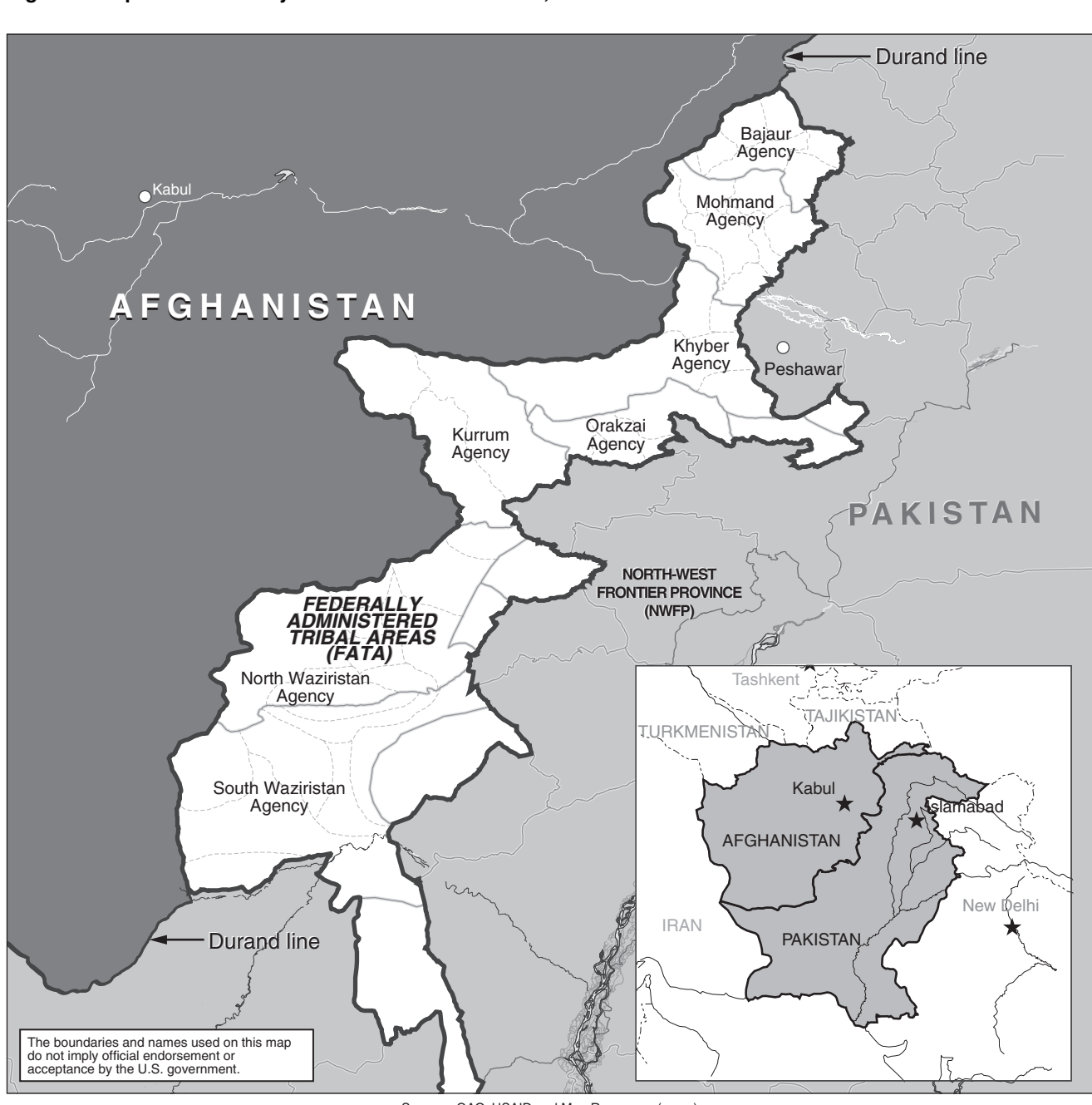
Figure 1: Map of the Federally Administered Tribal Areas, Pakistan