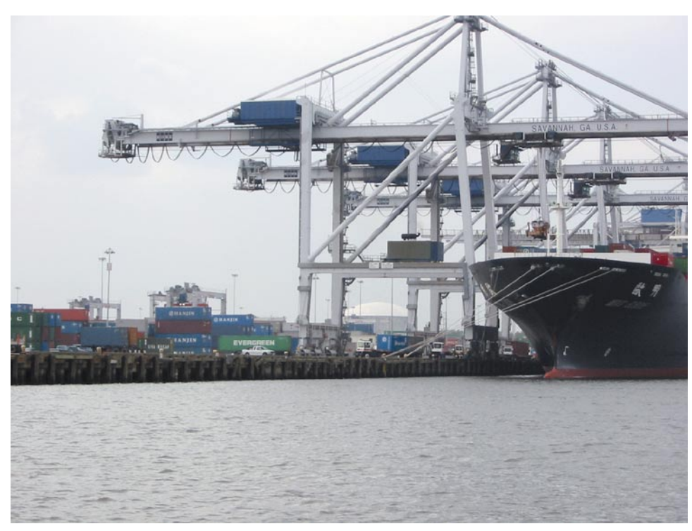
Figure 2: A Commercial Container Vessel and Related Infrastructure at a Seaport

There is a wide range of vulnerabilities at strategic seaports, including critical infrastructure such as bridges and refineries in close proximity to open shoreline, shipping containers with unknown contents, and an enormous volume of foreign and domestic shipping traffic. Figure 2 illustrates typical commercial port infrastructure and operations.