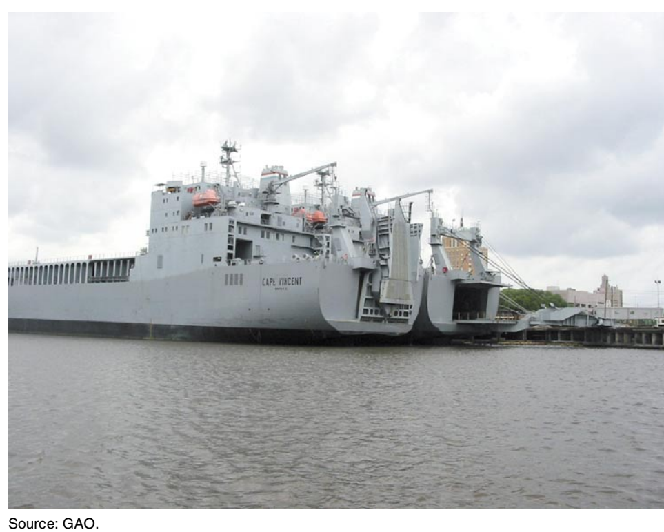
Figure 1: Reserve Sealift Ships Berthed at a Commercial Seaport

The military also uses commercial seaports for deployments such as those to operations in the Balkans. The Departments of Defense and Transportation have identified 17 seaports on the Pacific, Atlantic, and Gulf Coasts (13 commercial ports, 1 military port, and 3 military ammunition ports) as "strategic," meaning that they are necessary for use by DOD in the event of a large scale military deployment.