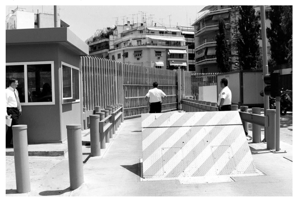
Figure 3: New Security Fence, Gate, and Vehicle Barrier at a U.S. Embassy