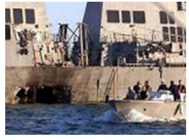
Metro bombings in London.

was capable of targeting commercial ships with great ease. Other operations of this kind include the 7/7