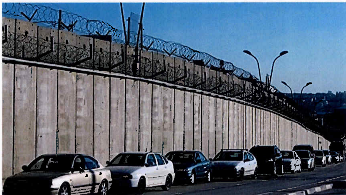
Palestinian drivers wait beside Israel's separation barrier to cross through Qalandria checkpoint between Jerusalem and Ramallah