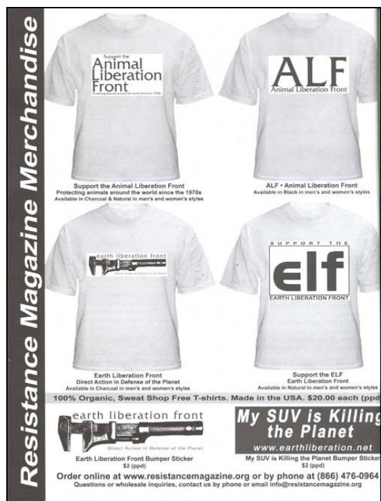
Resistance Magazine Merchandise page