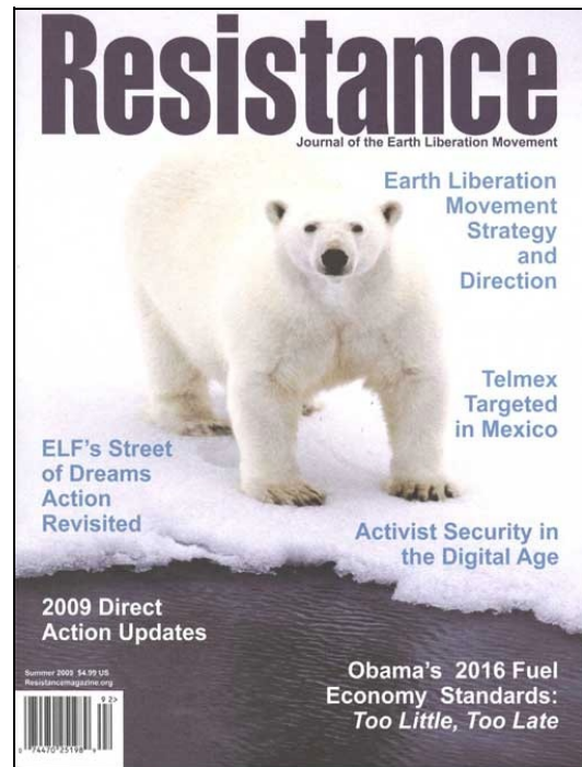
Resistance magazine Summer 2009

Below are excerpts from the publication.