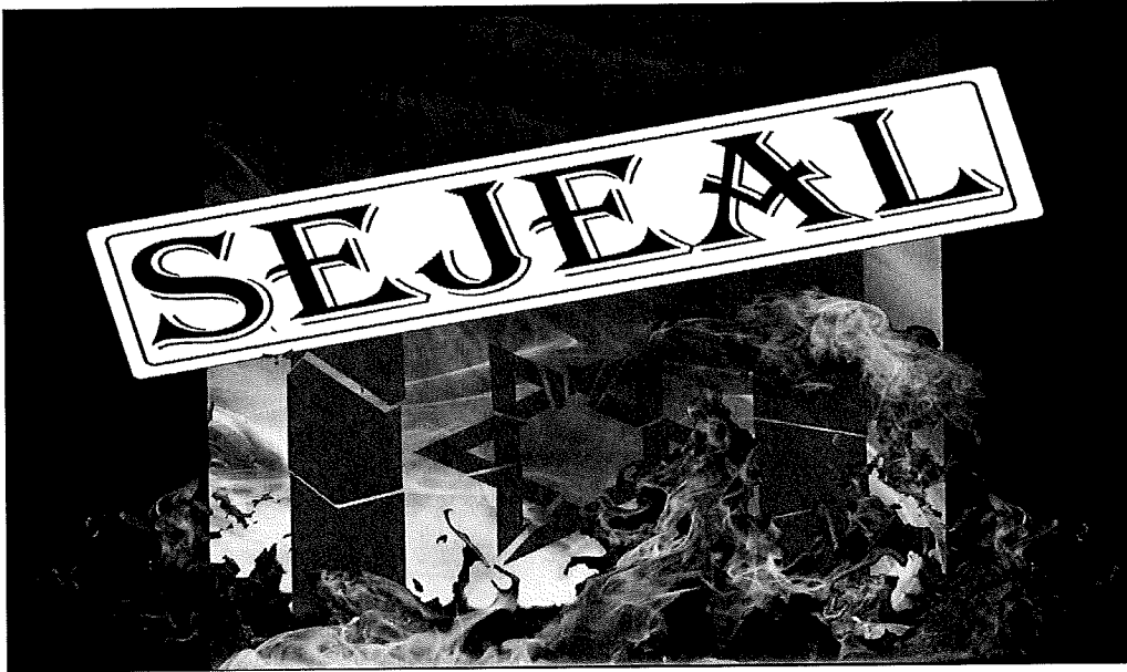
Victim-2: Israeli Telecommunications Provider

b. Defendant modified the contents of the website to display the text “Sejeal,” and to display imagery of a burning Israeli flag. The following is a screenshot of the defacement of the Victim-1 website: