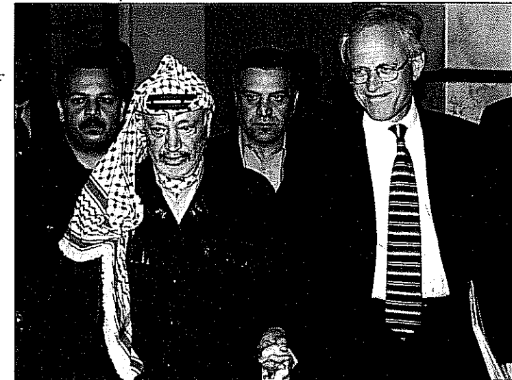
Palestinian Prime Minister Yasser Arafat meets with U.S. Ambassador to Israel to discuss the peace process.

4) requests the Secretary-General to report to the Council within twenty-four hours on the implementation of this resolution. ●