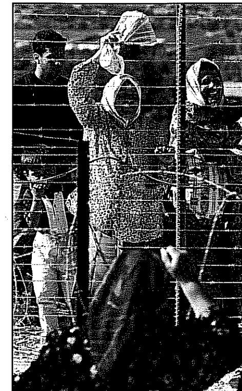
A Palestinian woman from Lebanon shouts and waves at her relatives living in Israel through a barbed wire fence in the northern village of Jurdeikh May 31.

Israel started pulling its troops out of southern Lebanon six weeks ahead of its July 7 deadline and rushed to finish the withdrawal after the rapid collapse of its militia ally, the South