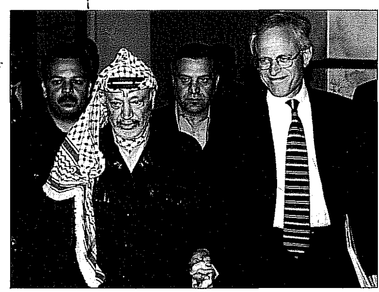
Palestinian Prime Minister Yasser Arafat meets with U.S. Ambassador to Israel to discuss the peace process.

4) requests the Secretary-General to report to the Council within twenty-four bours on the implementation of this resolution.