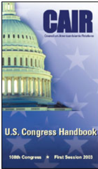
2003 Congressional Handbook