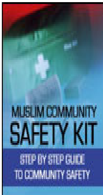
Muslim Community Safety Kit