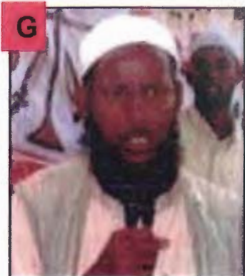
Mukhtar Robow "Abu Mansuur"