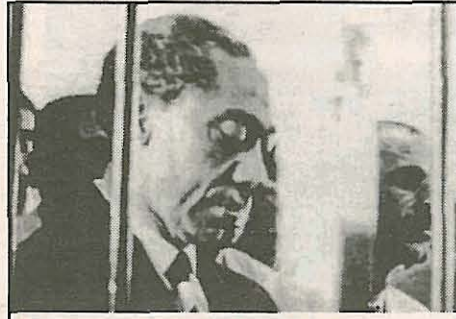
Sayyid Qutb, like all the revivalists mentioned in this issue, spent time in prison. In this photograph, Qutb is sentenced to imprisonment that ultimately led to his torture and execution by the Egyptian government.

It is significant to note that all of these revivalists were imprisoned at some point in their lives. It illustrates how threatening the word of truth is to forces that upheld